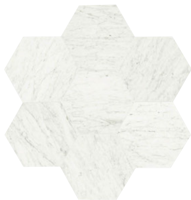
CARRARA WHITE M701 18" x 20-3/4" Hexagon – Polished