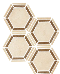
TORREON T711 6" Hexagon Mosaic Honed