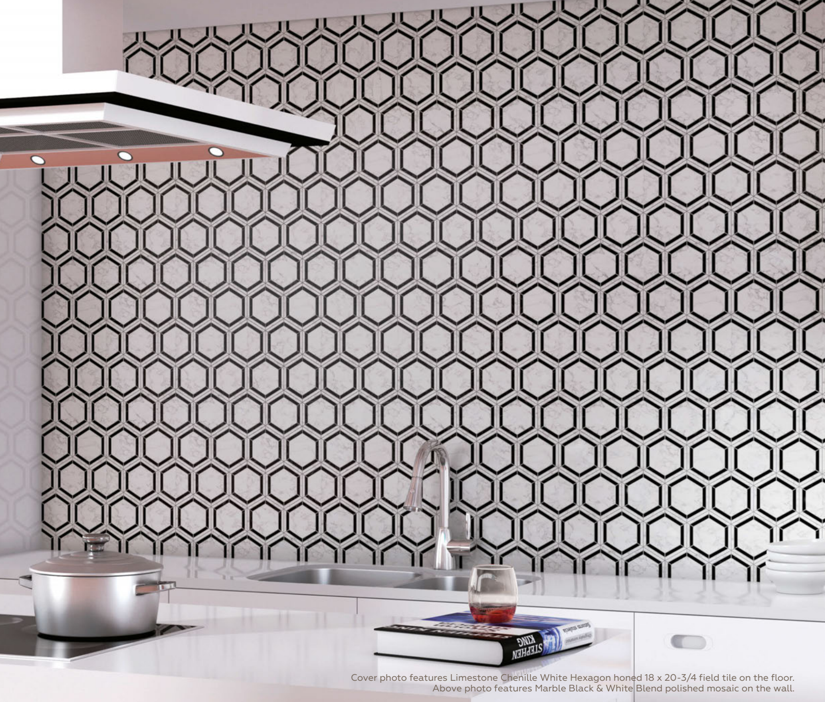
Cover photo features Limestone Chenille White Hexagon honed 18 x 20-3/4 field tile on the floor. Above photo features Marble Black & White Blend polished mosaic on the wall.