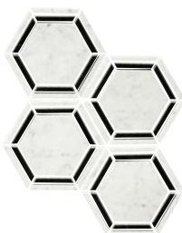
BLACK/WHITE BLEND M753 6" Hexagon Mosaic Polished