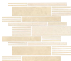
TORREON T711 Random Linear Mosaic* Polished, Honed & Scraped