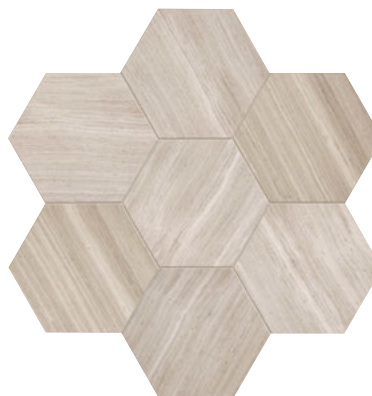
CHENILLE WHITE L191 18" x 20-3/4" Hexagon – Honed