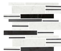
BLACK/ WHITE BLEND M753 Multi Random Linear Mosaic* Polished, Honed & Scraped