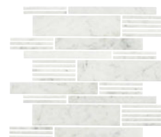
CARRARA WHITE M701 Random Linear Mosaic* Polished, Honed & Scraped