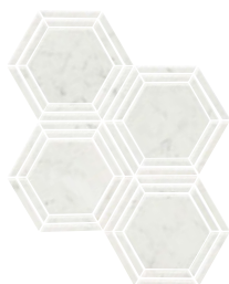
CARRARA WHITE M701 6" Hexagon Mosaic Polished