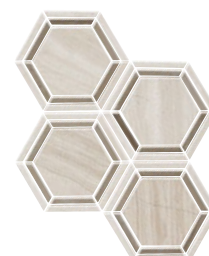
CHENILLE WHITE L191 6" Hexagon Mosaic Honed