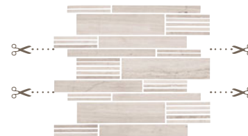
CHENILLE WHITE L191 Random Linear Mosaic* Polished, Honed & Scraped

* Mosaic can be cut into thirds to create interlocking decorative border